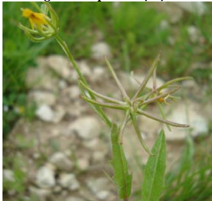
Rhagadiolus stellatus (12)