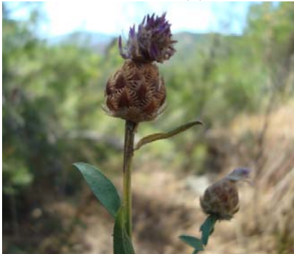
Centaurea triumfettii (7)