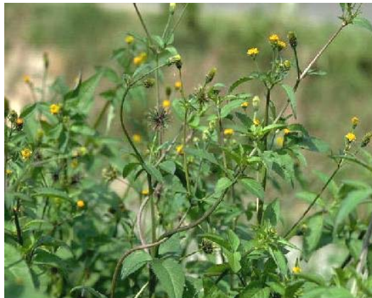
Bidens pilosa (17)