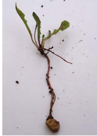
Aetheorhiza bulbosa (16)