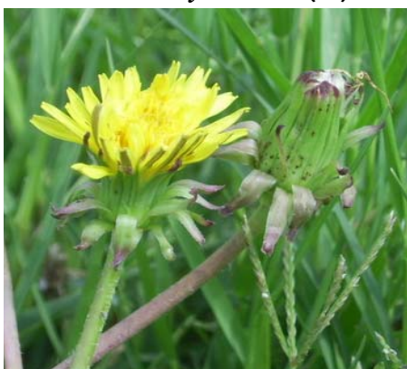
Taraxacum officinale (13)