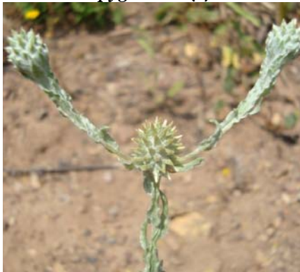
Filago eriocephala (10)