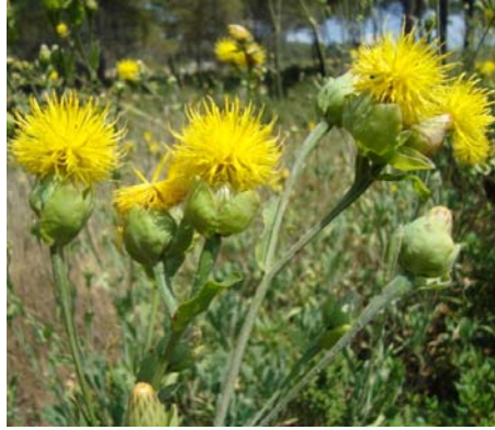
Centaurea ptosimopappa (2)