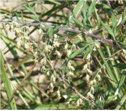
Artemisia velorum (3)