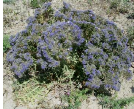
Cardopatum corymbosum (6)