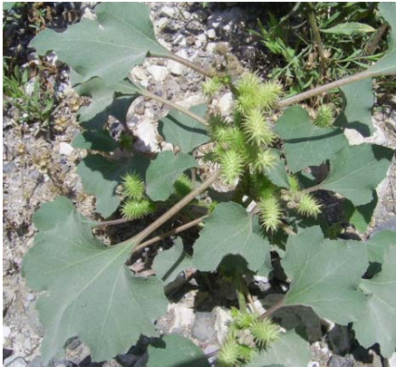
Xanthium strumarium (15)