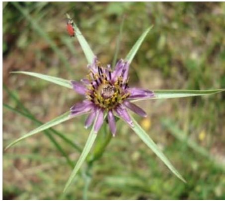
Tragapogon coelesyriacus (14)