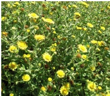
Pulicaria dysentrica (11)