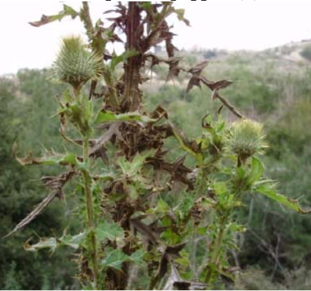
Cirsium vulgare (4)