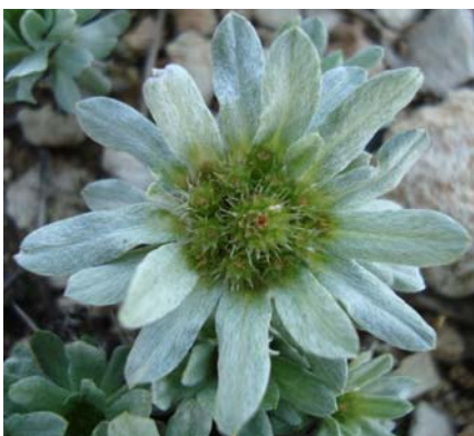
Evax pygmaea (8)