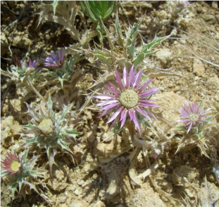
Carlina lanata (5)