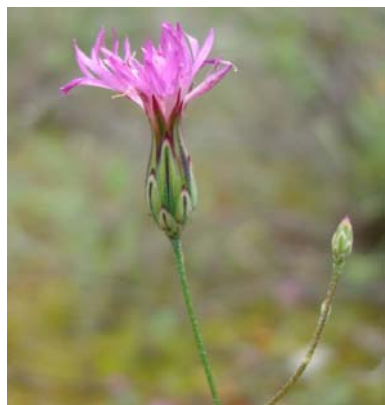
Crupina crupinastrum (9)