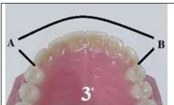
Figure (2): The circumferential arc distance between the distal surface of the left and right canines

with a dental floss through the contact points of these teeth, it was then sectioned and measured. This parameter was repeated three times and the average value was calculated and recorded for this measurement (Figure 2).