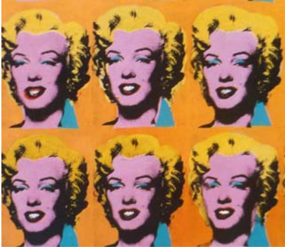
1960 ( ) : .5 24