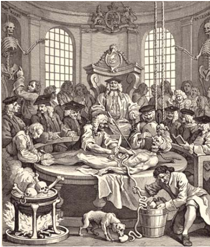
1751 (" " ) : .16