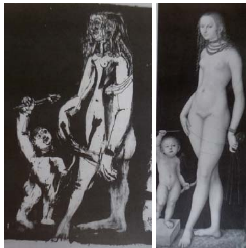
1530 ( ) : .21