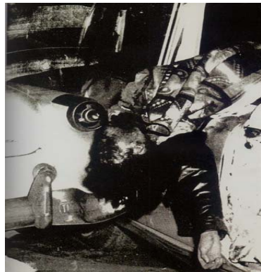
1963 ( ) : .17