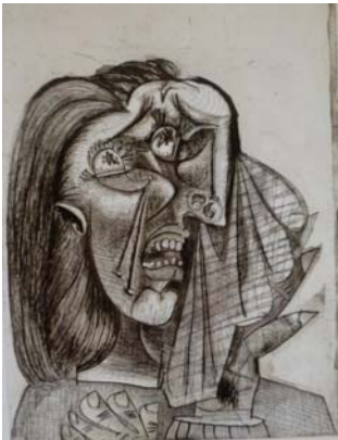
1937 ( )